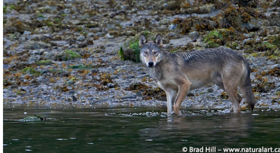
Wading Coastal Gray Wolf. Nikon D4s with 600mm f4 VR. 1/1000s @ f6.3. ISO 6400

Our journey will end in Port McNeill and you will depart with memories and photographs of a spectacular area abundant with the wonders of nature.