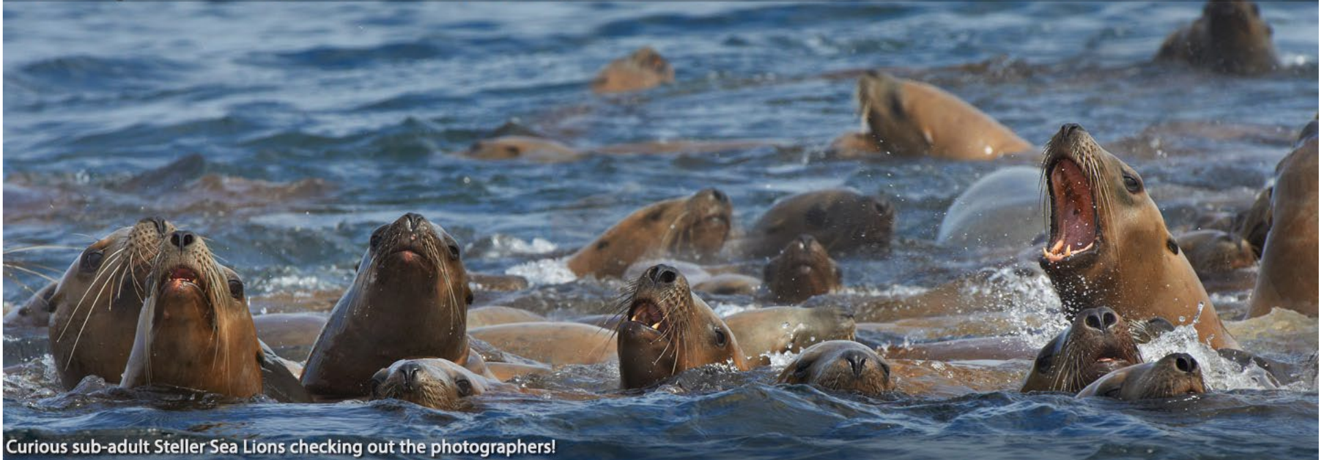
Curious sub-adult Steller Sea Lions checking out the photographers!

breaching, spy-hopping (where an Orca will raise its head out of the water and remain motionless while it surveys the scene) and more. The mountainous topography of the surrounding islands and mainland BC that's unique to this region provides us with stunning natural backdrops to work with. There's simply no better place to photograph Orcas!