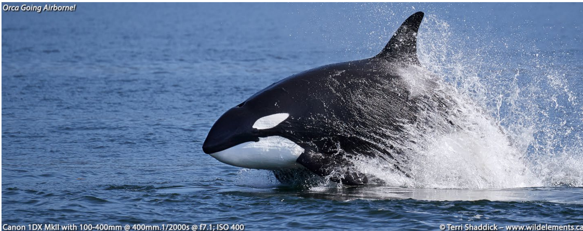
Orca Going Airborne!

Canon 1DX MkII with 100-400mm @ 400mm.1/2000s @ f7.1; ISO 400