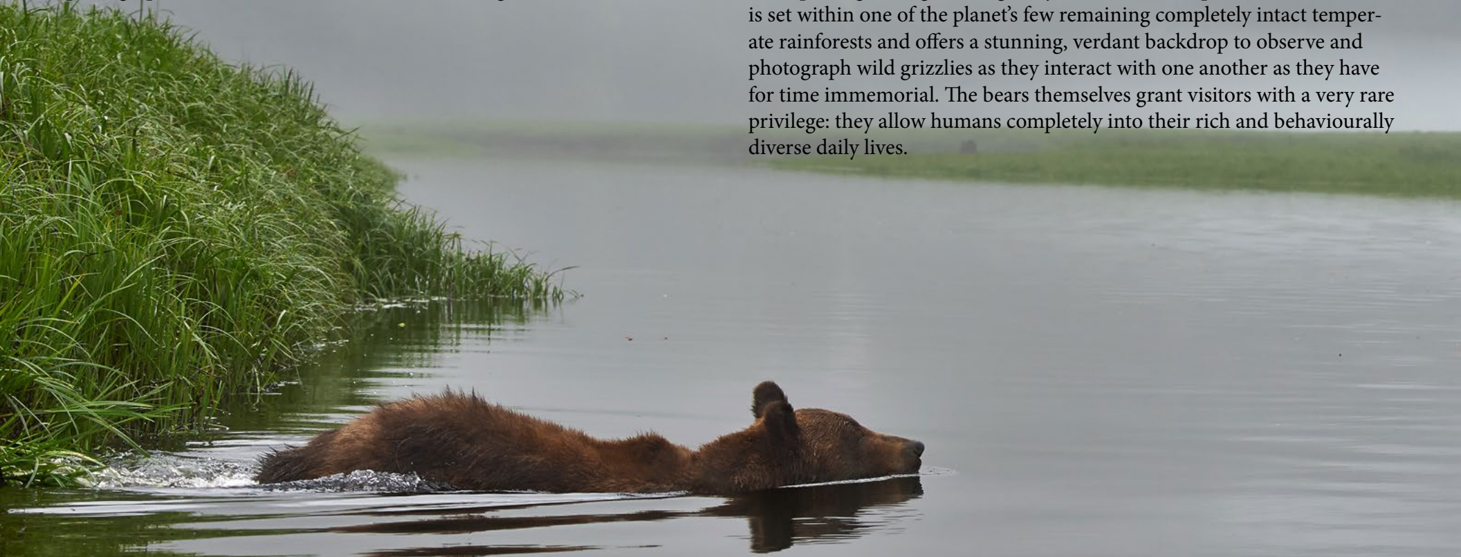
The Khutzeymateen Estuary. Accessible only at high tide, the Khutzeymateen estuary is a grass and wildflower covered grizzly garden (complete with water features!). We'll split our time in the field between the estuary and several of the alluvial fans found in the main Khutzeymateen Inlet.

The Khutzeymateen Grizzly Sanctuary. The 39,000 hectare (96,000 acre) Khutzeymateen Grizzly Sanctuary is Canada's only Grizzly Bear sanctuary and is located at the tip of a long and remote inlet on the northern coast of British Columbia. There are no roads, settlements, or even campsites in the region – it is true pristine wilderness. The bulk of the sanctuary is closed to the public – only two professional guides have licenses to lead very small groups into the heart of this majestic and globally unique ecosystem. The inlet is home to about 50 resident grizzlies, with many more passing through during the year. This remote piece of wilderness is set within one of the planet's few remaining completely intact temperate rainforests and offers a stunning, verdant backdrop to observe and photograph wild grizzlies as they interact with one another as they have for time immemorial. The bears themselves grant visitors with a very rare privilege: they allow humans completely into their rich and behaviourally diverse daily lives.