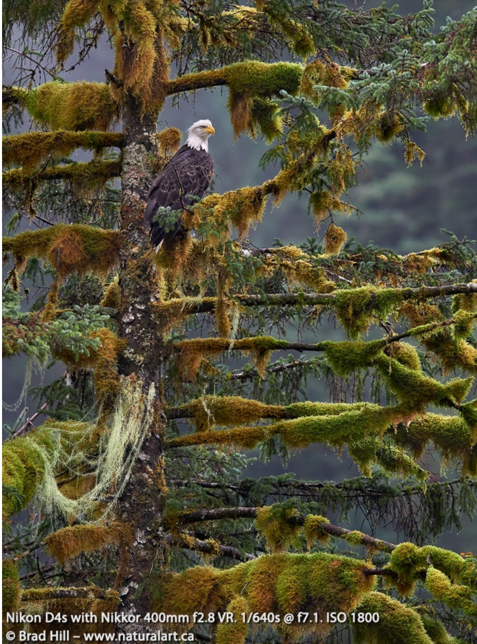
Nikon D4s with Nikkor 400mm f2.8 VR. 1/640s @ f7.1. ISO 1800

The Tree of Life. Bald Eagles are always great subjects, but finding them perched in settings like this is like a photographer's dream come true!