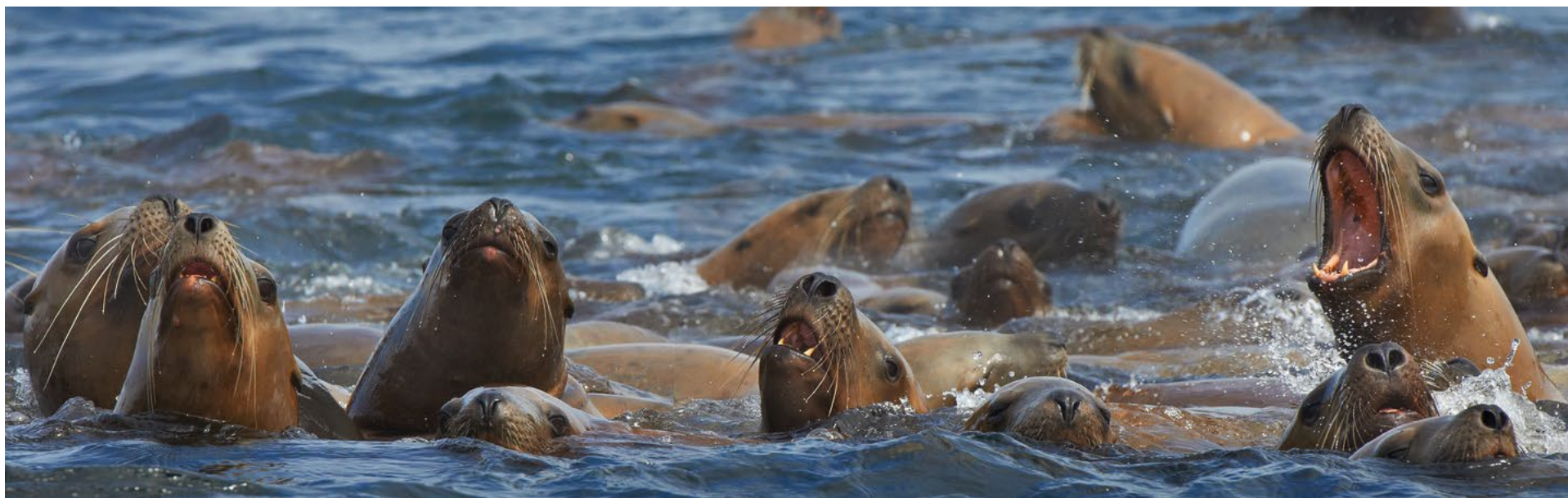
The Welcoming Committee. Steller Sea Lions can be seen throughout the channels and inlets of the Great Bear Rainforest, but large groups like this are more commonly encountered on the outside and more exposed islands and coastlines.

Arrive in Prince Rupert. Make your way to the Highliner Hotel & Conference Centre to check in and stow your gear. Official check-in time is 3 PM, but if your room is ready before that they will let you check in earlier. You can stow your luggage with them while waiting to check-in. If you arrive early in the day feel free to sightsee or check the town out. Plan on