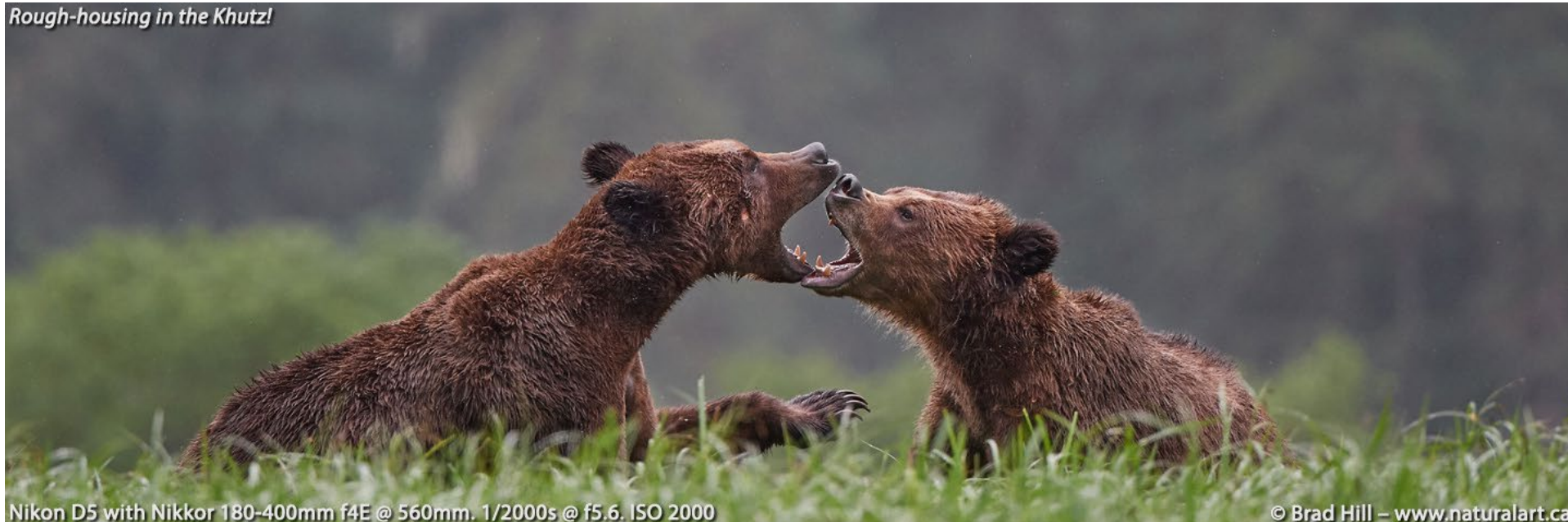
Rough-housing in the Khutz!

Nikon D5 with Nikkor 180-400mm f4E @ 560mm. 1/2000s @ f5.6. ISO 2000