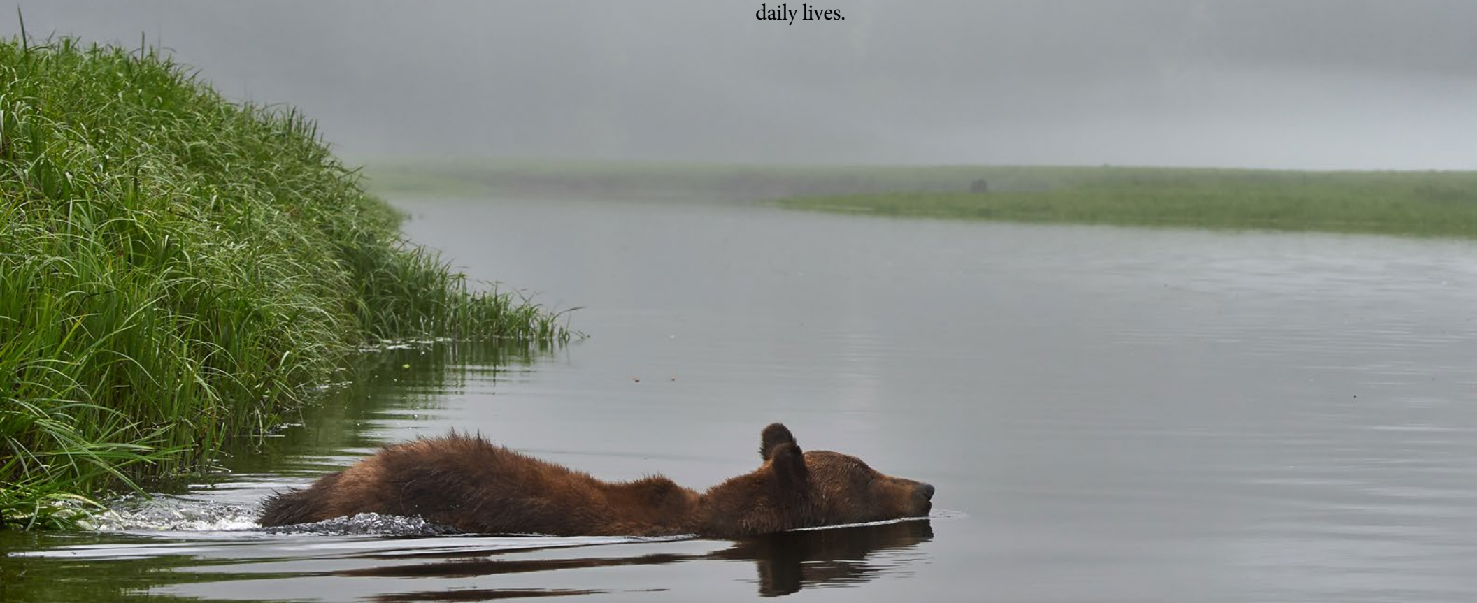
The Khutzeymateen Estuary. Accessible only at high tide, the Khutzeymateen estuary is a grass and wildflower covered grizzly garden (complete with water features!). We'll split our time in the field between the estuary and several of the alluvial fans found in the main Khutzeymateen Inlet.

The Khutzeymateen Grizzly Sanctuary. The 39,000 hectare (96,000 acre) Khutzeymateen Grizzly Sanctuary is Canada's only grizzly bear sanctuary and is located at the tip of a long and remote inlet on the northern coast of British Columbia. There are no roads, settlements, or even campsites in the region - it is true pristine wilderness. The bulk of the sanctuary is closed to the public and only two professional guides are allowed to lead very small groups into the heart of this majestic, globally unique ecosystem. The inlet is home to about 50 resident grizzlies, with many more passing through during the year. This remote piece of wilderness is set within one of the planet's few remaining completely intact temperate rainforests and offers a stunning, verdant backdrop to observe and photograph wild grizzlies as they interact with one another as they have for time immemorial. The bears themselves grant visitors with a very rare privilege: they allow humans completely into their rich and behaviourally diverse daily lives.