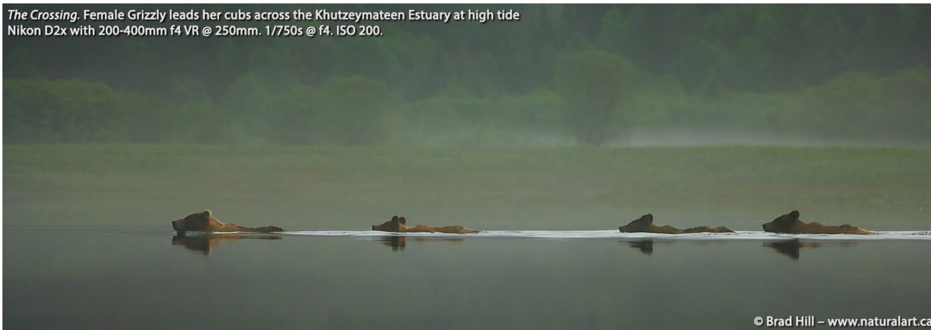
The Crossing. Female Grizzly leads her cubs across the Khutzeymateen Estuary at high tide Nikon D2x with 200-400mm f4 VR @ 250mm. 1/750s @ f4. ISO 200.