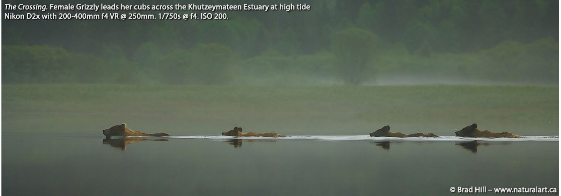
The Crossing. Female Grizzly leads her cubs across the Khutzeymateen Estuary at high tide Nikon D2x with 200-400mm f4 VR @ 250mm. 1/750s @ f4. ISO 200.