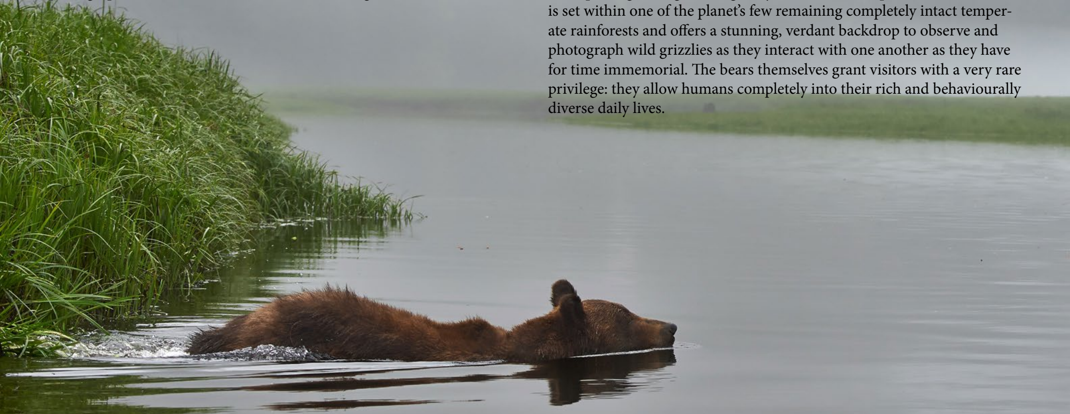
The Khutzeymateen Estuary. Accessible only at high tide, the Khutzeymateen estuary is a grass and wildflower covered grizzly garden (complete with water features!). We'll split our time in the field between the estuary and several of the alluvial fans found in the main Khutzeymateen Inlet.

The Khutzeymateen Grizzly Sanctuary. The 39,000 hectare (96,000 acre) Khutzeymateen Grizzly Sanctuary is Canada's only Grizzly Bear sanctuary and is located at the tip of a long and remote inlet on the northern coast of British Columbia. There are no roads, settlements, or even campsites in the region – it is true pristine wilderness. The bulk of the sanctuary is closed to the public – only two professional guides have licenses to lead very small groups into the heart of this majestic and globally unique ecosystem. The inlet is home to about 50 resident grizzlies, with many more passing through during the year. This remote piece of wilderness is set within one of the planet's few remaining completely intact temperate rainforests and offers a stunning, verdant backdrop to observe and photograph wild grizzlies as they interact with one another as they have for time immemorial. The bears themselves grant visitors with a very rare privilege: they allow humans completely into their rich and behaviourally diverse daily lives.