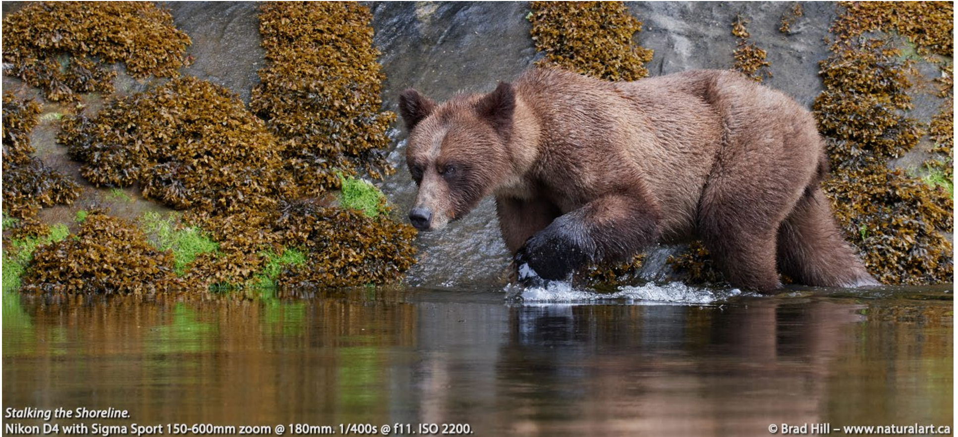
Stalking the Shoreline.

Nikon D4 with Sigma Sport 150-600mm zoom @ 180mm. 1/400s @ f11. ISO 2200.