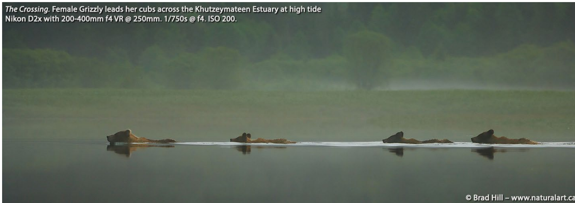
The Crossing. Female Grizzly leads her cubs across the Khutzeymateen Estuary at high tide Nikon D2x with 200-400mm f4 VR @ 250mm. 1/750s @ f4. ISO 200.