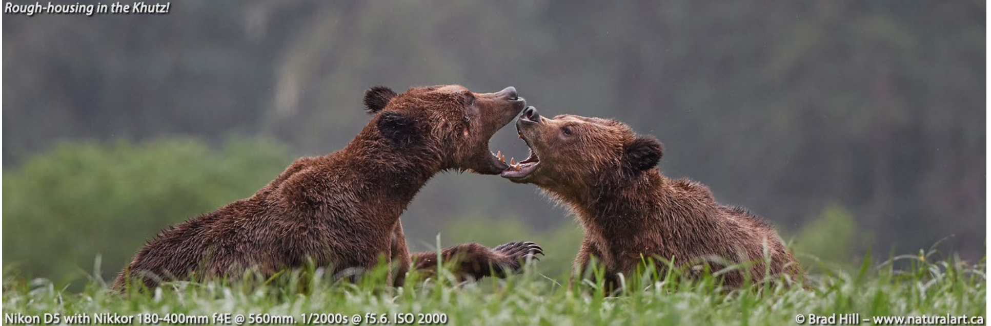
Rough-housing in the Khutz!