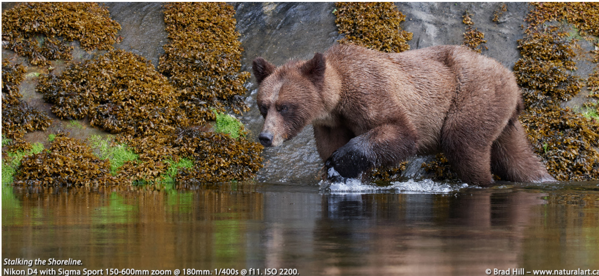
Stalking the Shoreline.

Nikon D4 with Sigma Sport 150-600mm zoom @ 180mm. 1/400s @ f11. ISO 2200.