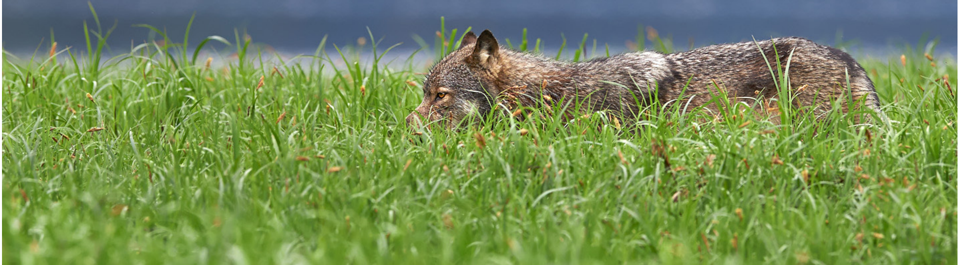
Ghost of the Coast. Coastal Gray Wolves are not rare in the Khutzeymateen, but their secretive nature makes them a challenge to see or photograph. Nikon D4s with 400mm f2.8 VR. 1/500s @ f5.6. ISO 350.