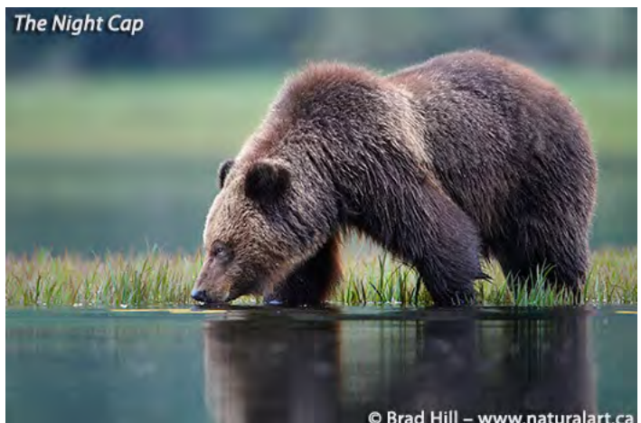
The Night Cap

Arrive in Prince Rupert. Make your way to the Eagle Bluff Bed & Breakfast to check in and stow your gear.