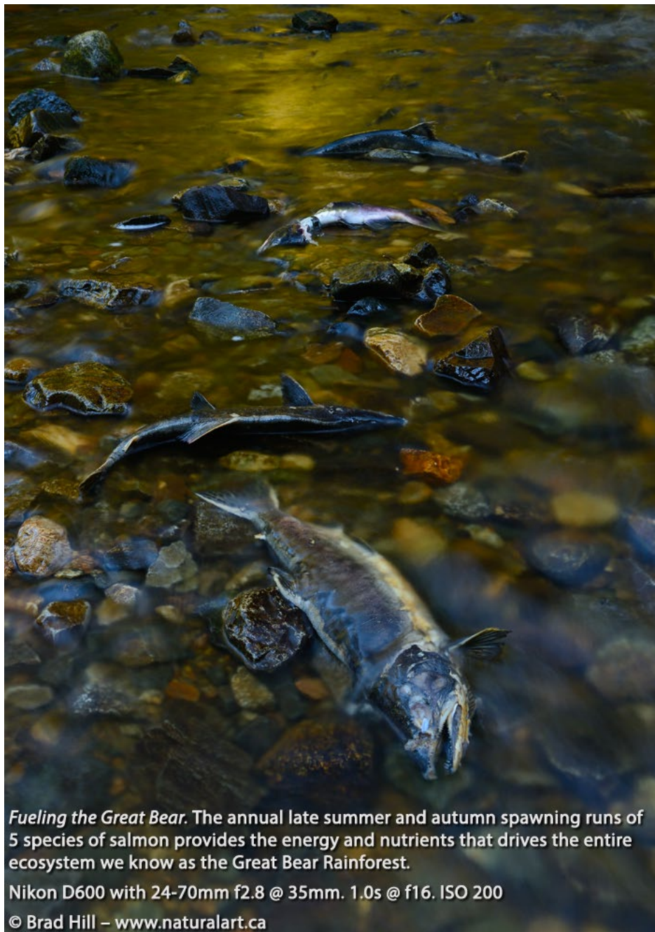
Fueling the Great Bear. The annual late summer and autumn spawning runs of 5 species of salmon provides the energy and nutrients that drives the entire ecosystem we know as the Great Bear Rainforest.

Nikon D600 with 24-70mm f2.8 @ 35mm. 1.0s @ f16. ISO 200