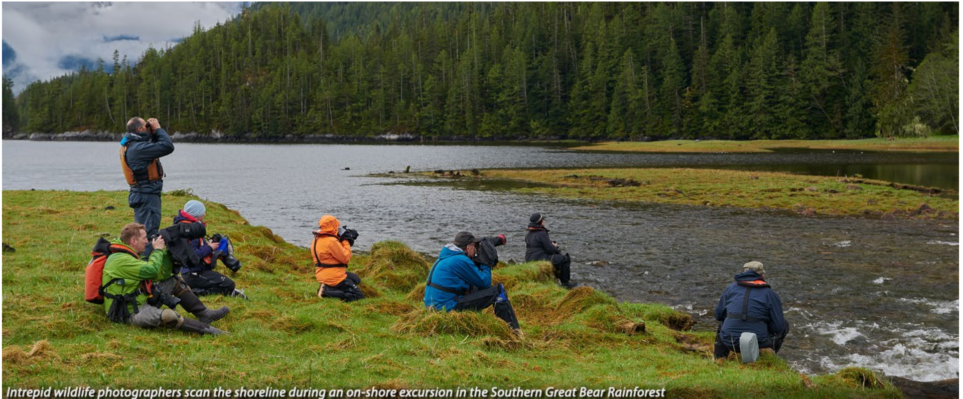
Intrepid wildlife photographers scan the shoreline during an on-shore excursion in the Southern Great Bear Rainforest