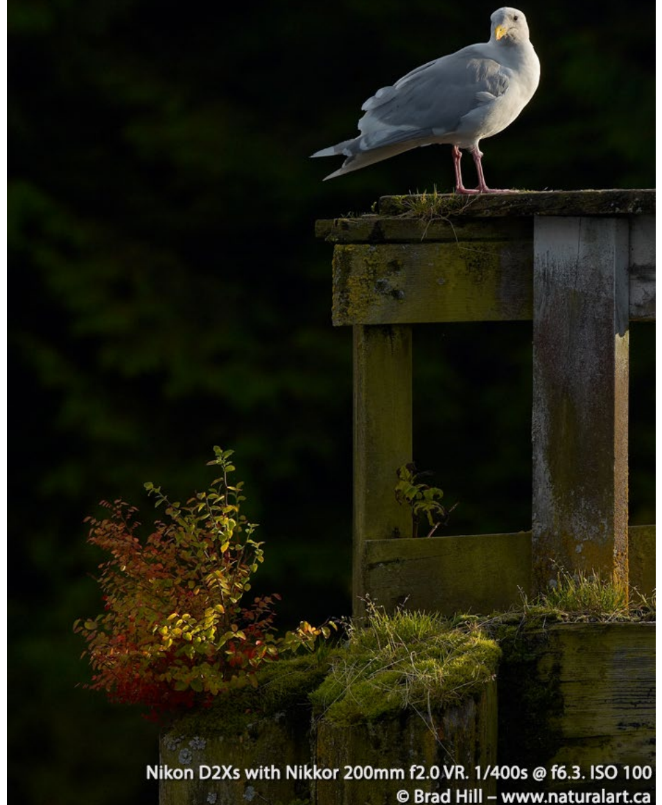
Nikon D2Xs with Nikkor 200mm f2.0 VR. 1/400s @ f6.3. ISO 100

Seeking Natural Art! While finding and working with several species of "charismatic megafauna" is a big part of our experience, we'll be approaching this trip with an attitude of finding and capturing any form of natural beauty and natural art we can find.