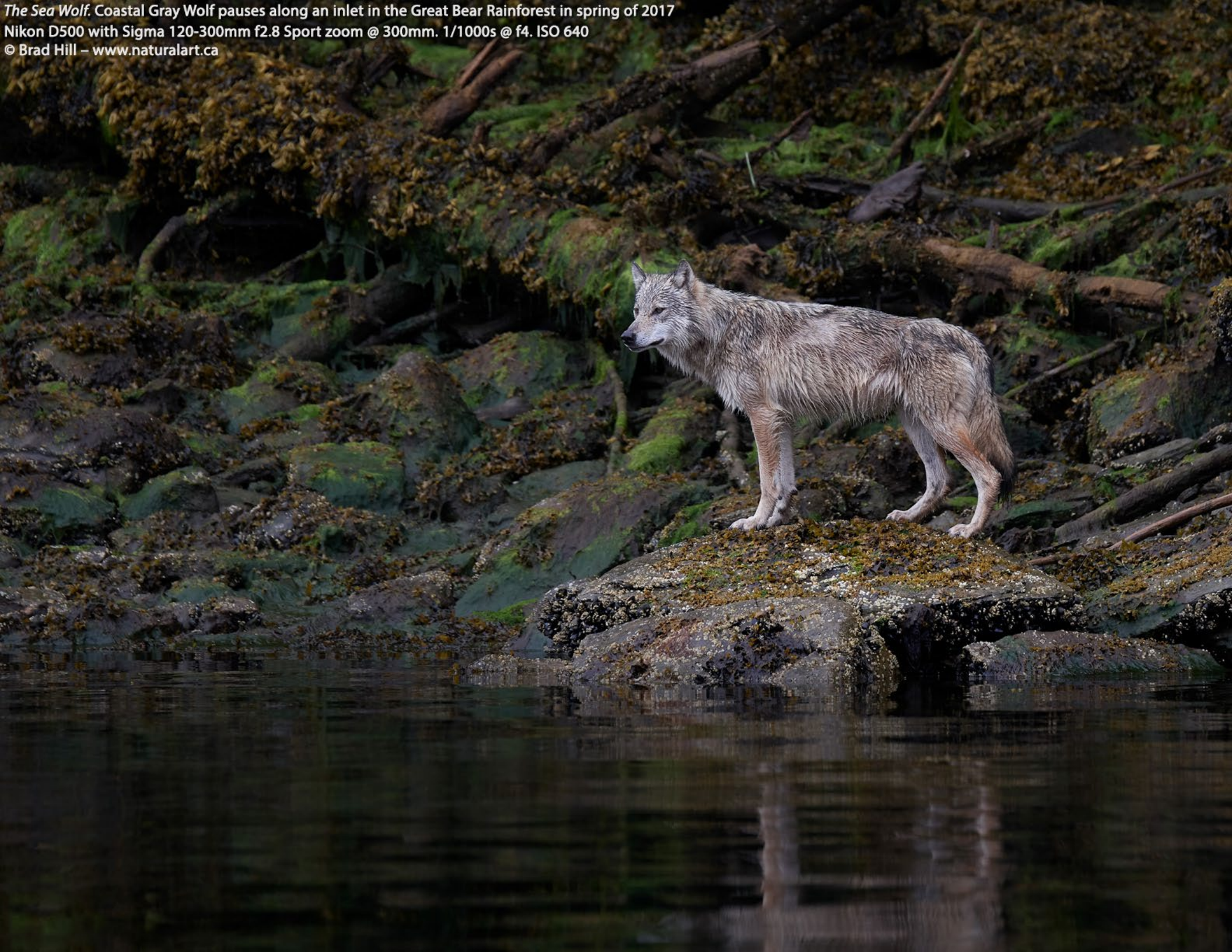
The Sea Wolf. Coastal Gray Wolf pauses along an inlet in the Great Bear Rainforest in spring of 2017 Nikon D500 with Sigma 120-300mm f2.8 Sport zoom @ 300mm. 1/1000s @ f4. ISO 640