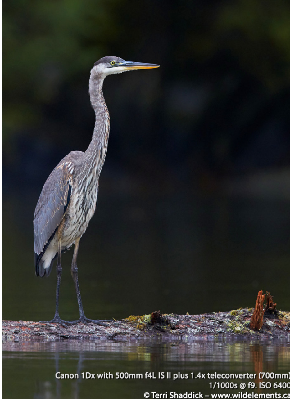
Great Blue Herons are found in many of the Great Bear Rainforest's inlets.