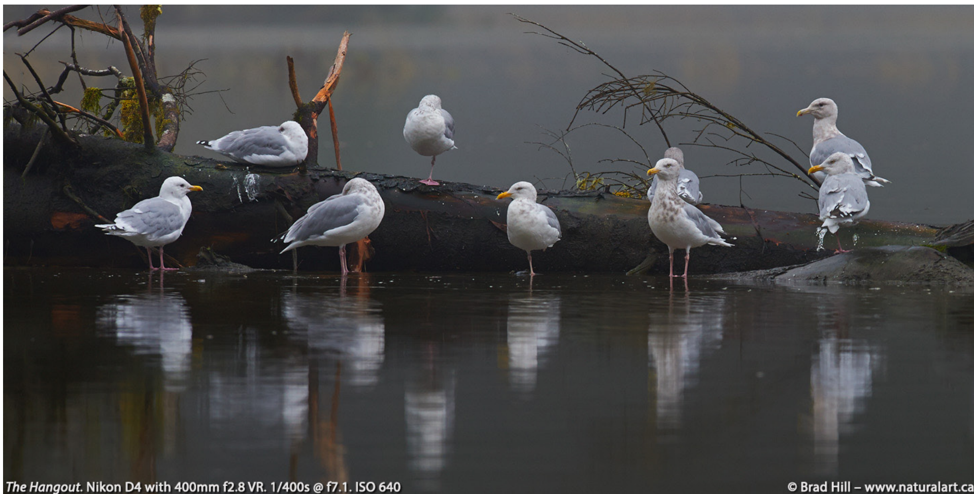
The Hangout. Nikon D4 with 400mm f2.8 VR. 1/400s @ f7.1. ISO 640