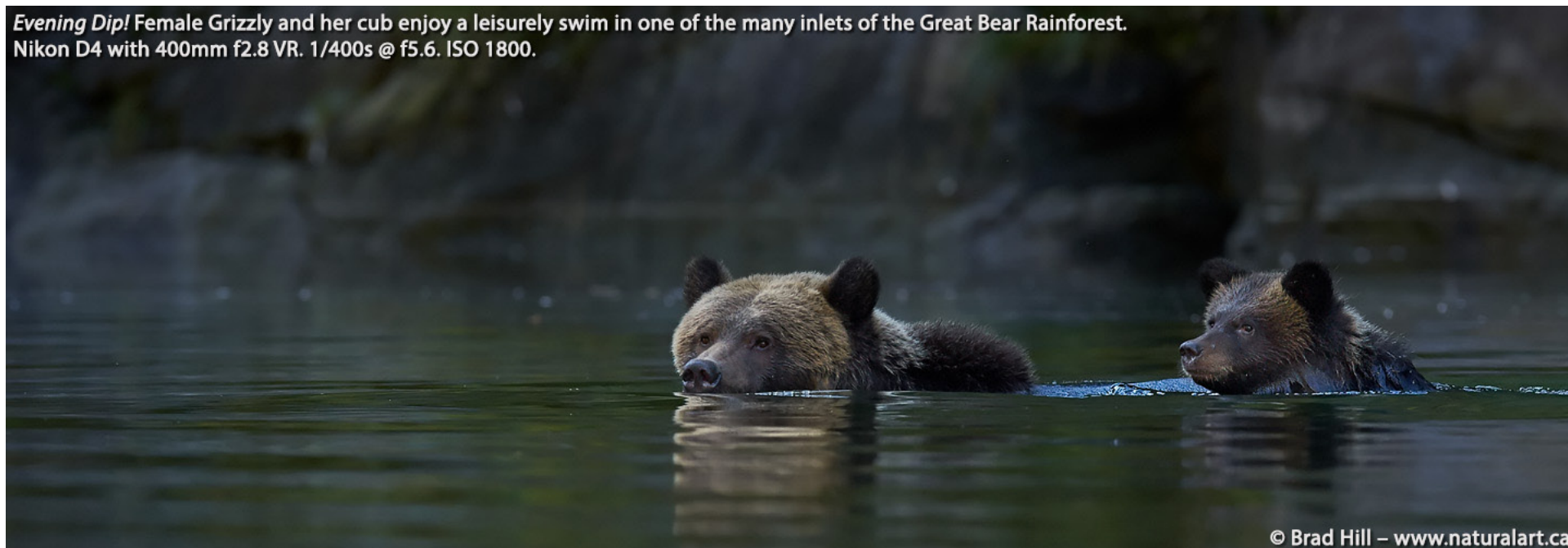
Evening Dip! Female Grizzly and her cub enjoy a leisurely swim in one of the many inlets of the Great Bear Rainforest. Nikon D4 with 400mm f2.8 VR. 1/400s @ f5.6. ISO 1800.