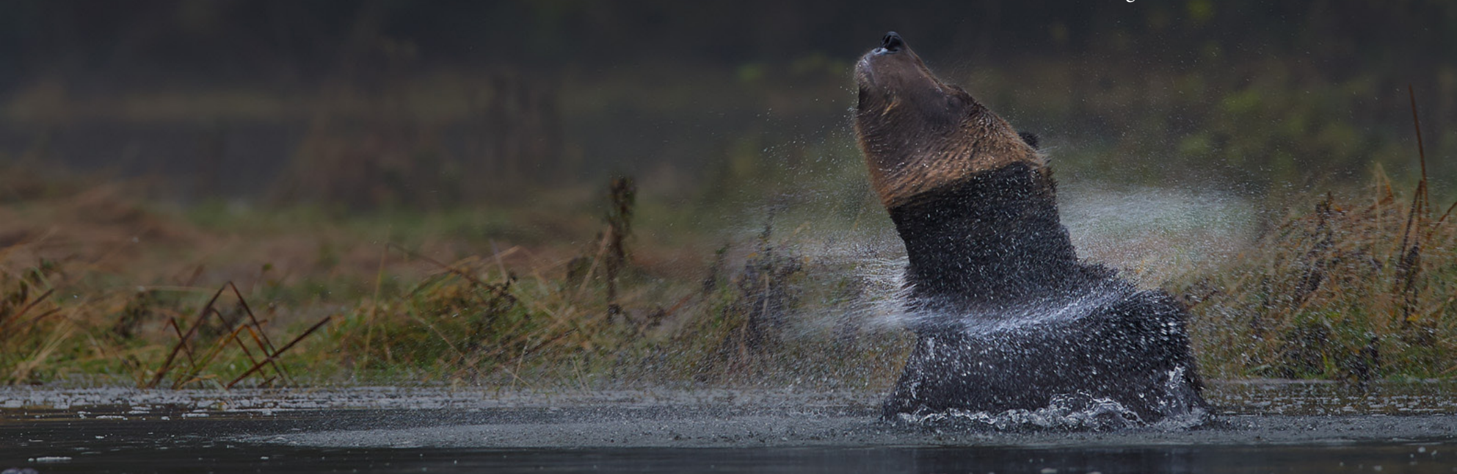
Shake it Up! Adult male Grizzly pausing in his pursuit of prey for a quick shake.

Nikon D4 with 400mm f2.8 VR. 1/400s @ f6.3. ISO 560.