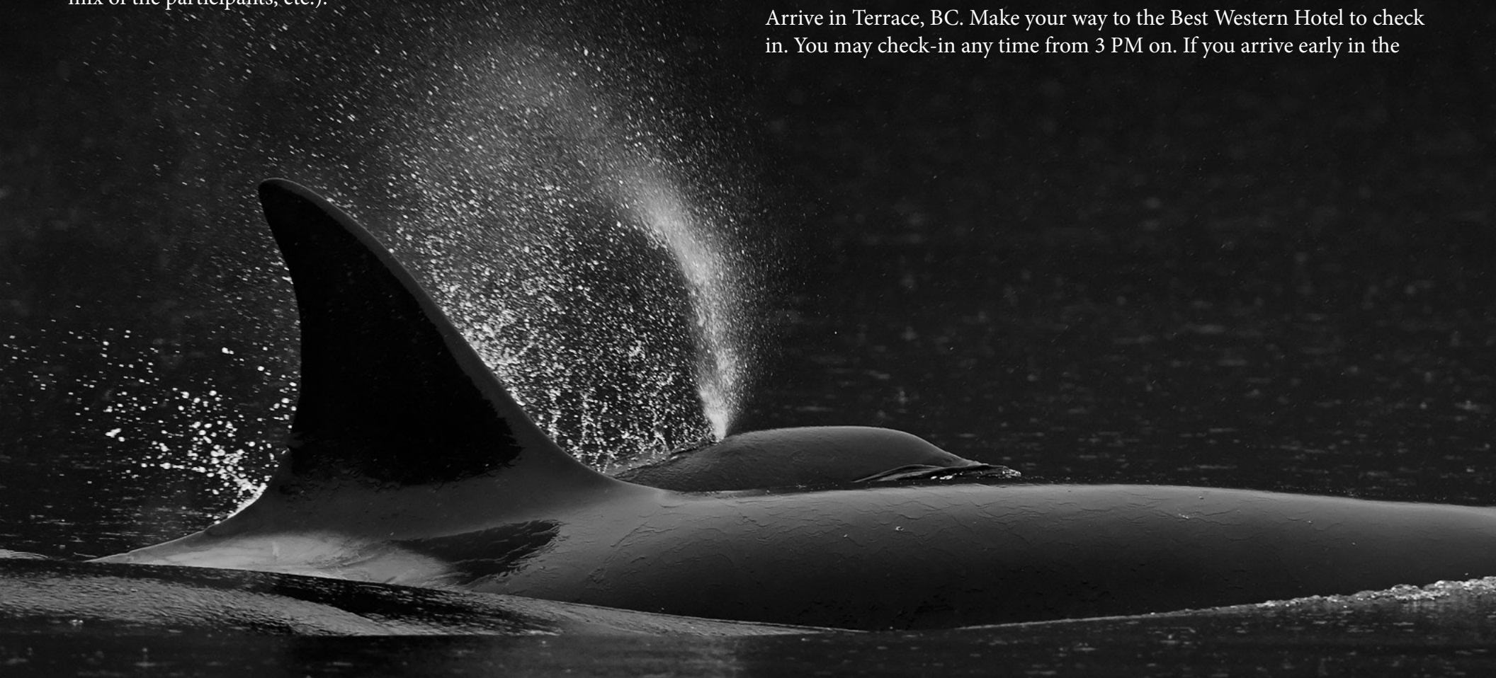
The Blow! Killer Whales cruise the narrow inlets of the Great Bear Rainforest in search of prey. This female and her calf were part of a small pod of 5 transient Killer Whales hunting for their primary prey – marine mammals. Nikon D4 with 400mm f2.8 VR. 1/1000s @ f5.6. ISO 2000.

Arrive in Terrace, BC. Make your way to the Best Western Hotel to check in. You may check-in any time from 3 PM on. If you arrive early in the