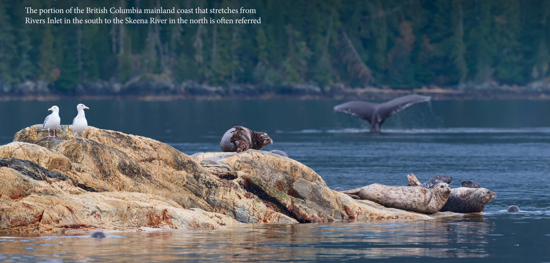
Photo-bombed by a Humpback! The Great Bear Rainforest is a very target-rich environment – pure nirvana to a wildlife photographer!

to as “The Great Bear Rainforest”. At over 64,000 square kilometers (25,000 sq. mi.) it is the largest tract of temperate coastal rainforest left on planet Earth. Here the coastal mountains meet the Pacific Ocean – the area is cut by hundreds of steep-sided inlets/fjords and there are countless islands. The more inland portions of the Great Bear Rainforest (AKA the “ Inner Great Bear ”) are characterized by thick forests cut by steep-sided inlets – here forest literally meets salt water! Another characteristic feature is the presence of wide, fertile estuaries where inland rivers and streams drain into the inlets and fjords. These estuaries are wildlife viewing and wildlife photography hotspots!