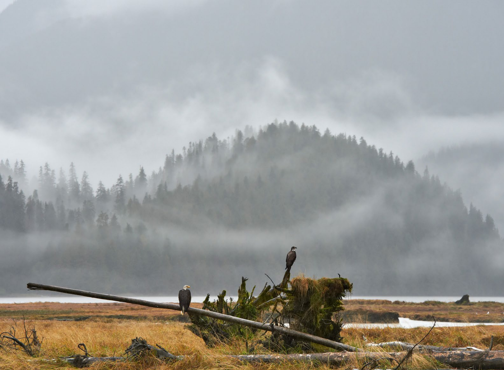
Eagles in the Mist. There is no better place to capture images of eagles and other wildlife with stunning backdrops than the Great Bear Rainforest. Nikon D4 with 70-200mm f4 VR @ 150mm. 1/160s @ f8. ISO 720.