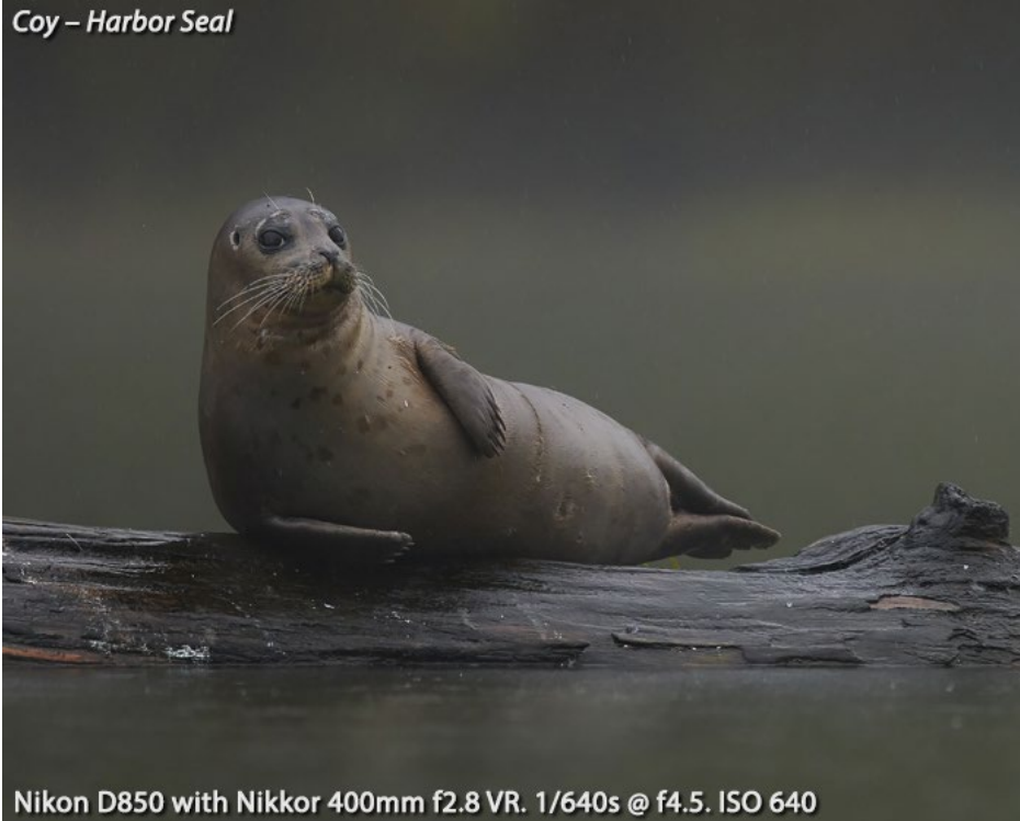
Coy – Harbor Seal

Nikon D850 with Nikkor 400mm f2.8 VR. 1/640s @ f4.5. ISO 640