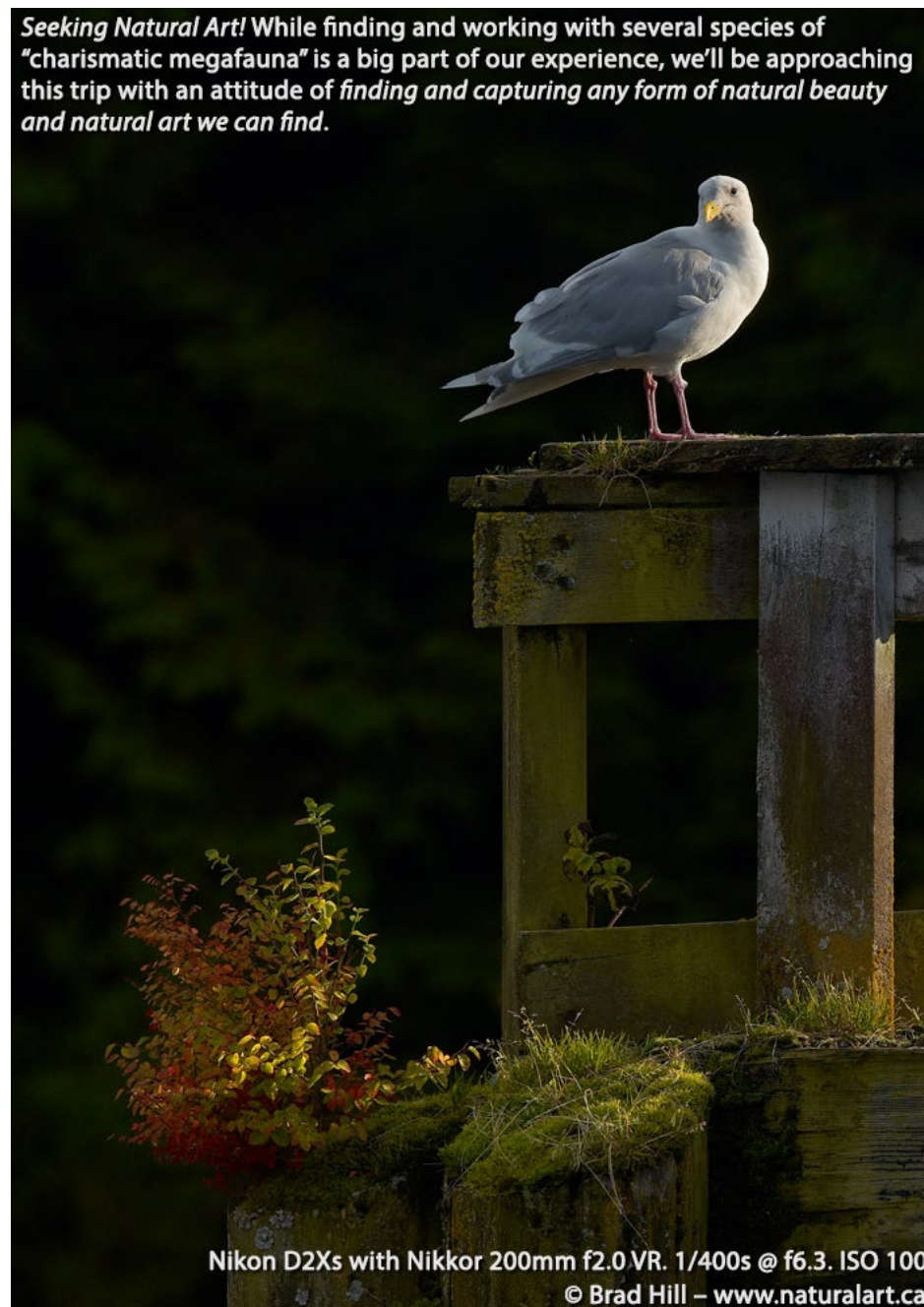
Nikon D2Xs with Nikkor 200mm f2.0 VR. 1/400s @ f6.3. ISO 100

Seeking Natural Art! While finding and working with several species of “charismatic megafauna” is a big part of our experience, we’ll be approaching this trip with an attitude of finding and capturing any form of natural beauty and natural art we can find .