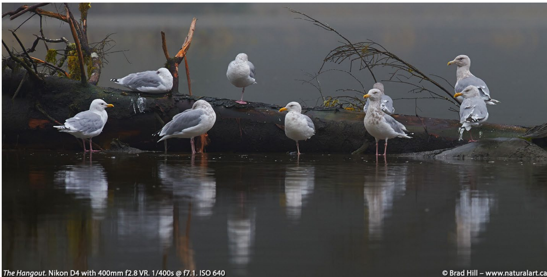
The Hangout. Nikon D4 with 400mm f2.8 VR. 1/400s @ f7.1. ISO 640