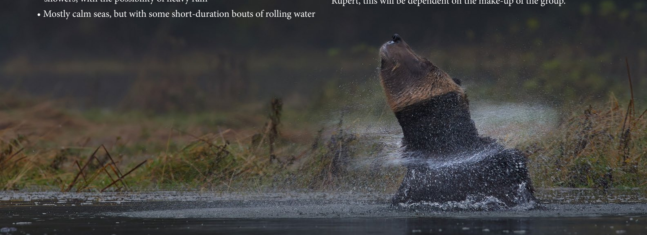
Shake it Up! Adult male Grizzly pausing in his pursuit of prey for a quick shake.

While in the Great Bear Rainforest we will be staying on the Afterglow boat, a 60-foot Gulf Commander power boat. Please be aware that it is likely you will be asked to share a berth on the Afterglow . As in Prince Rupert, this will be dependent on the make-up of the group.