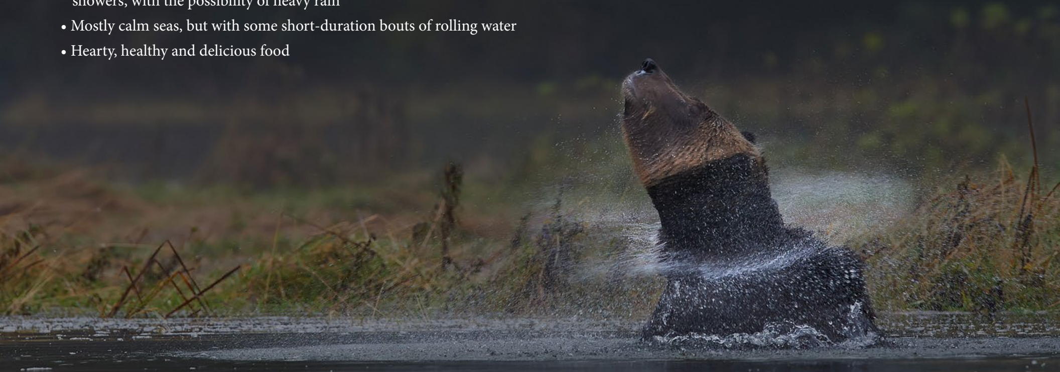
Shake it Up! Adult male Grizzly pausing in his pursuit of prey for a quick shake.

While in the Great Bear Rainforest we will be staying on the Ocean Light II sailboat, a 71-foot ketch. Please be aware that it is likely you will be asked to share a berth on the Ocean Light II . As in Prince Rupert, this will be dependent on the make-up of the group.