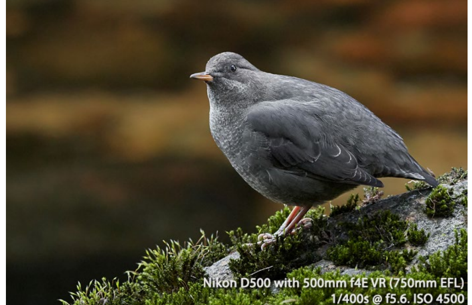
American Dipper. Dippers are constant companions on salmon streams in the Great Bear Rainforest.

groups of photographers are working with the same subject.