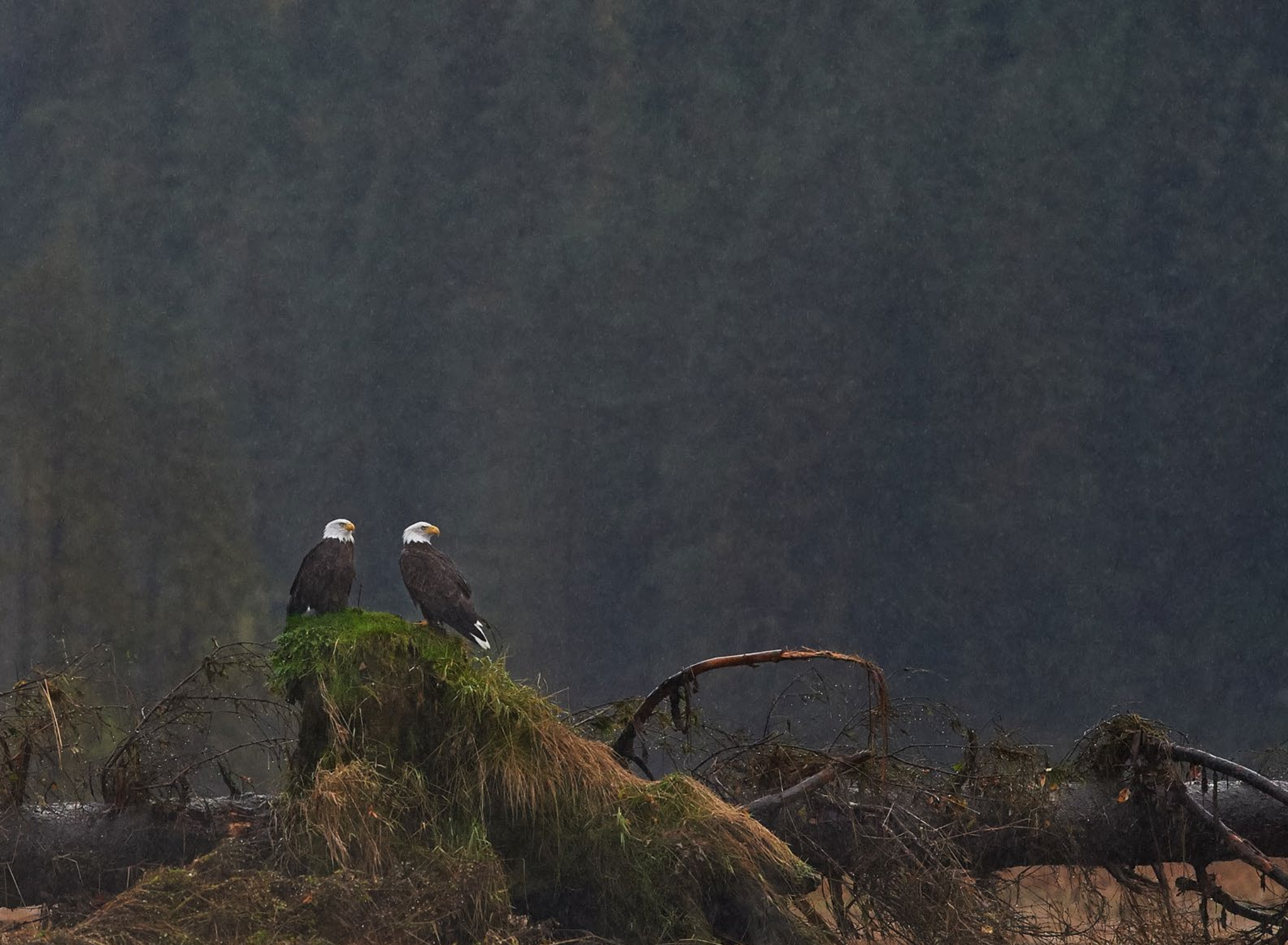
Chillin' in the Great Bear. These adult Bald Eagles seem to be enjoying a little down-time on a rainy day in a coastal estuary! Nikon D4s with 400mm f2.8 VR. 1/400s @ f5.6. ISO 3200.