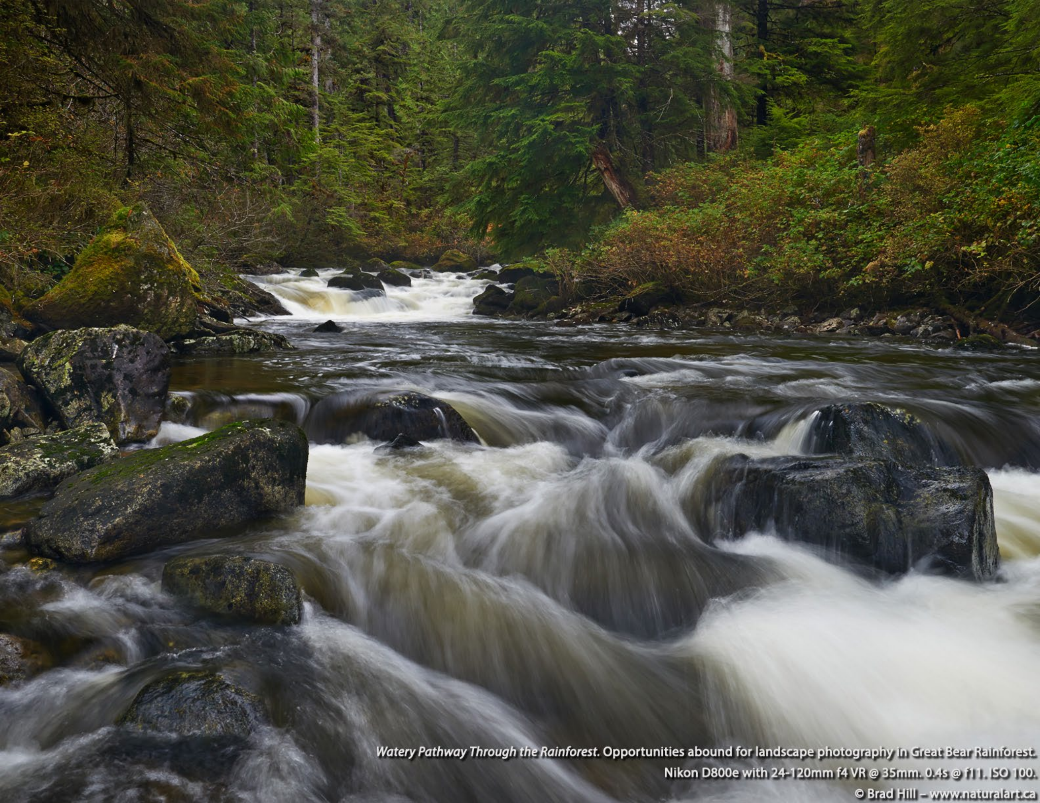
Watery Pathway Through the Rainforest. Opportunities abound for landscape photography in Great Bear Rainforest.

Nikon D800e with 24-120mm f4 VR @ 35mm. 0.4s @ f11. ISO 100.